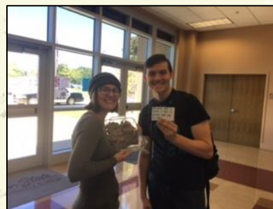
Students won brownies after solving handful of riddles