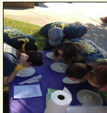
One of the teams working hard trying to find the worm

Check out our Facebook page for reminders of upcoming events! (Jefferson State SKD)