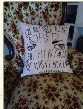
Quote by Zelda Fitzgerald