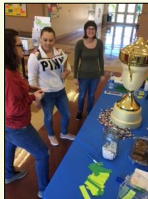
Students trying to guess the riddle by helping each other