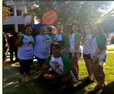
Clanton Team "Queen Peaches"

Pioneer Day was September 29, 2017 at the Jefferson campus. Pioneer Day was a celebration of Jefferson State 52 nd anniversary. This event included food, music, and the Amazing Race. Amazing Race practiced team building and created camaraderie as a Jeff State family. The Amazing Race had a series of activities including a station I was able to partake in called the Bubble whip. The purpose of the game was to engage in team spirit by cheering on your teammates as they were competing. So how do you play? There were six plates located around the table for each team member. On that plate was a piece of bubble gum hidden in two scoops of whipped cream. In order to get the bubble gum everyone needed to have their hands behind their back, and only use their mouth to find the bubble gum. Once the gum was found, two people from the team needed to blow one bubble each before time was called. Whoever had the lowest time out of all the groups plus team spirit won! After the games there was lunch served by culinary, dance offs, and even a frozen challenge. Which included a frozen T-Shirt in a cooler. Whoever was able to unfold the frozen T-shirt and put it on a team member won! This event was full of laughter and excitement to watch everyone run around and use their team spirit by working together as a team to win.