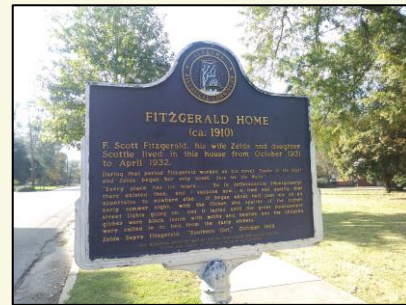
Information about home of Fitzgerald