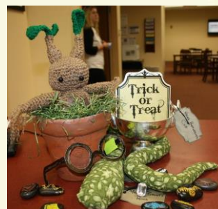
Scavenger hunt items