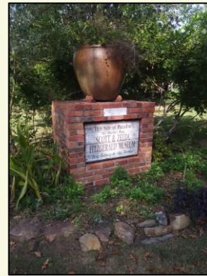
Entrance to the museum