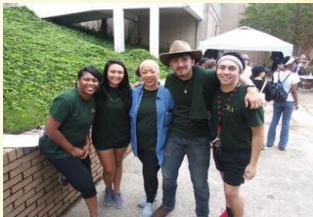
The Word Herd Getting ready to compete

Overall, the day was very fun, interesting, and exciting. The SKD officers had an opportunity to learn how to work together and learn about each others strengths and weaknesses. Even though the Word Herd did not come in first place, we all had a blast together (out of 27 teams we came in 13th). Next year we hope to beat the records and come up in the charts with everyone's help to make the team bigger and better! Stampede!!!