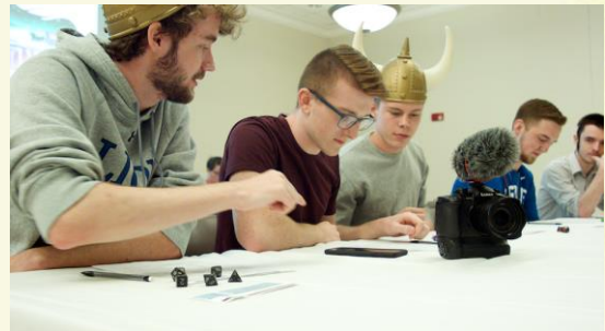
A student group plays D&D

SKD looks forward to more panels, more diverse topics, and more submissions from students, faculty, and members of the community all over Alabama for Pioneer Con 2019!