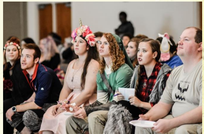
Students eagerly await the next question in the trivia game