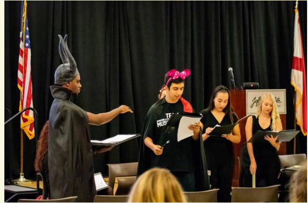
She Kills Monsters presentation