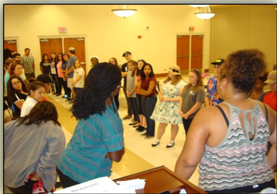
Students line up for the one-word-a-person storytelling