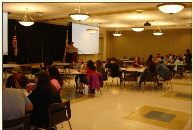
The Shelby campus multi-purpose room was full of students, faculty, and staff for the Improv Workshop

Do you have an item of interest to share with your fellow members? Do you want to be an active member of SKD, but do not know where to start? Contact us for further information.